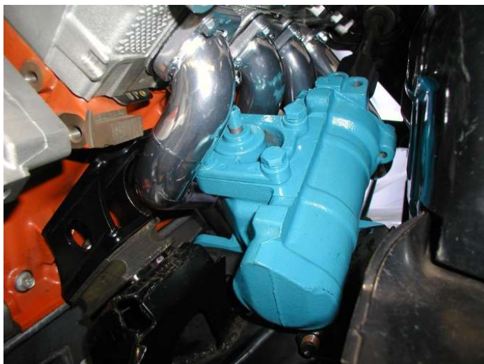
Pic2: Power-steering unit installed