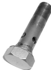
1-3/16" (Machining Required)