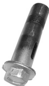
3/4" - OK

Oil filter adapters are supplied with either a 3/4" or a 1-3/16" hex head mounting bolt. If your adapter came with the 1-3/16" bolt, modification will be required by machining bolt head to .175 thickness.