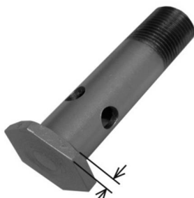
Machine to .175 thickness