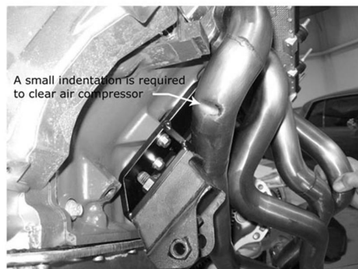
A small indentation is required to clear air compressor