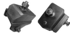
Modified stock rubber insulators shown.

Rubber Insulators are not included with engine mounts. The stock insulators can be used however, they will require modification. Insulators are available through Schumacher Creative Services of Seattle, WA. www.engine-swaps.com