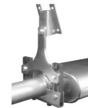
Shown: Muffler hanger bolted to the Muffler hanger body bracket.

Muffler hanger body brackets are required to mount the muffler hangers. Body brackets are mounted to the body panel behind the rear seat.