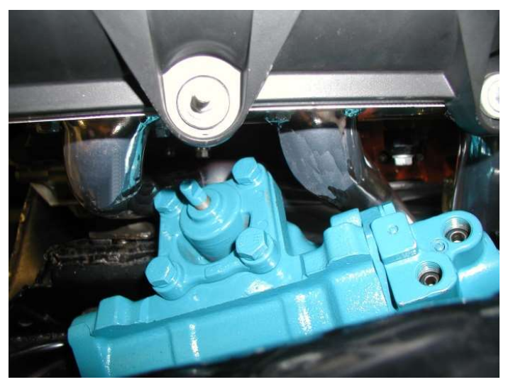
Pic3: Power-steering unit installed