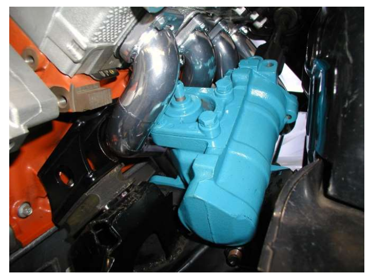
Pic2: Power-steering unit installed