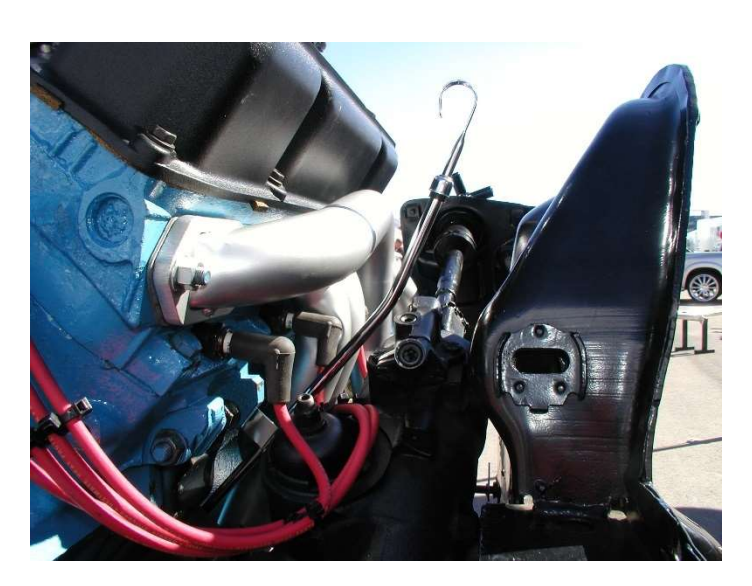
Modified stock dipstick.