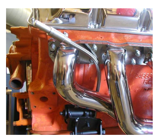
Milodon flexible dipstick.