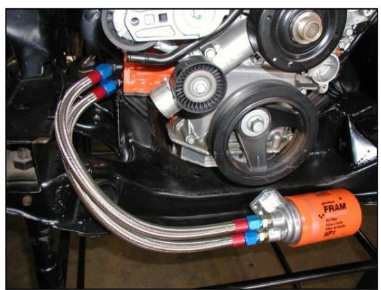
Remote filter mounted for illustration purposes only. Mount your filter to suit your application.

<sup>2</sup>Remote Mount Oil Filter Kit available through Milodon - Part #21560 (Not available through TTi)