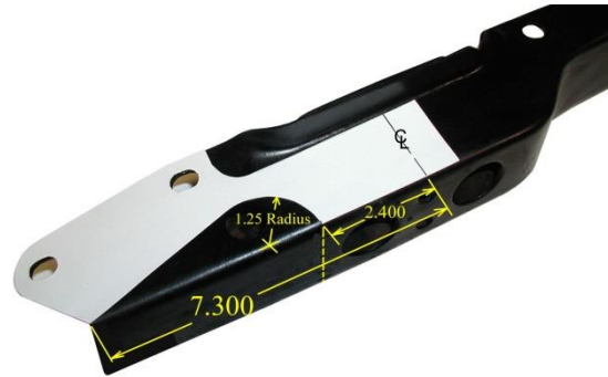
Dimensions for modifying a stock crossmember